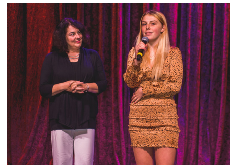
Teen resident shares her experiences.